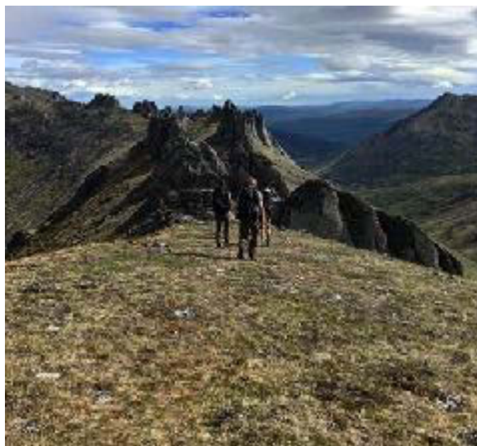
Backpacking in the White Mountains National Recreation Area, July 2019