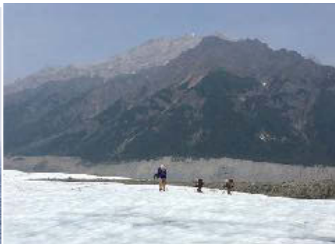
Hiking across Root Glacier in Wrangell St. Elias National Park, July 2019 Backpacking