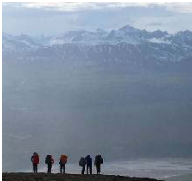
Backpacking in Denali State Park, June 2019