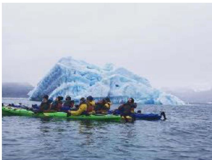
Sea kayaking off the coast of Valdez, July 2019